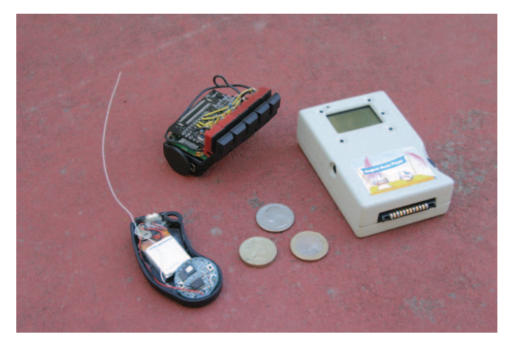
Figure 3. Handheld prototype components, including tagged presentation remote control (upper left), prototype mobile device (right), and RFID reader (bottom left). The remote control is tagged with an RFID tag (black circle on end), and the RFID reader is exposed to show its inner circuitry. (A Euro, a British Pound, and a U.S. quarter are included for scale.)

the desired application and loading a user's personal data. These technologies combine to support a model requiring "near zero" configuration—the minimum interaction necessary to perform a task. The system encapsulates an "intention" in a physical object; for example, "listen to your music on this room's sound system" could be encapsulated in a stylized box with a musical note attached to it.