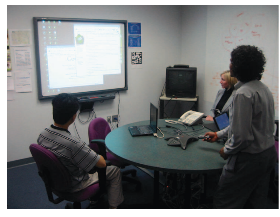
Figure 1. A mobile device can be used to import personal data into an interactive space by simply scanning a tag embedded in the space.

suited for all tasks due to their small displays and keyboards. This observation served as the inspiration for the Personal Server Project at Intel Research in 2001 [11], a model of computing in which mobile devices wirelessly use the superior user-interface capabilities of nearby infrastructure. Interactive spaces and even collections of PCs afford a rich user experience; wirelessly blending them together with mobile devices results in the best of both worlds. Fully realizing the synergy between mobile devices and interactive spaces requires a smooth integration process not encumbered by messy cables or elaborate connection and configuration menus.