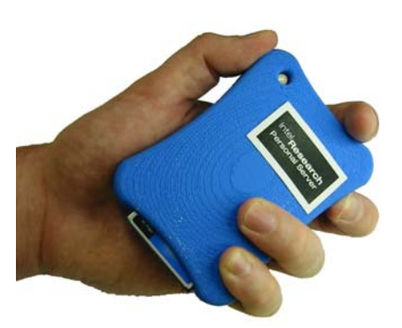
Figure 3 A Personal Server Prototype

Once again autonomic principles are required for this system to be successful, establishing a sense of self for the personal server and guarding against possible adverse data or programs that may be pushed onto it. In addition, proactive techniques are required for predicting the types of data the user needs, based on previous data access patterns, or the context of the user.